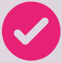
Figure 1: IHCC's Plans and Progress