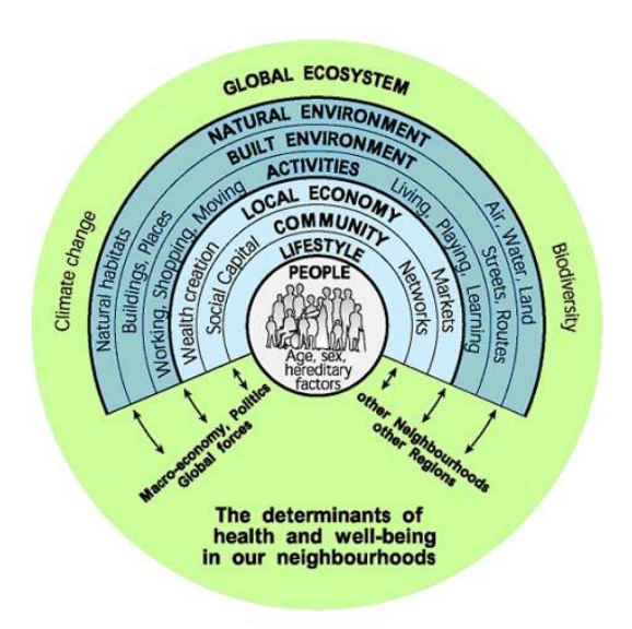
Figure 1: Barton and Grant (2006). The Health Map

WHIASU has published a <u>practical guide</u> to carrying out a HIA<sup>11</sup> which provides further information about the methodology used in HIA. The guide provides a reference point for the expectations for how a high quality HIA should be conducted and the approach to HIA in Wales.