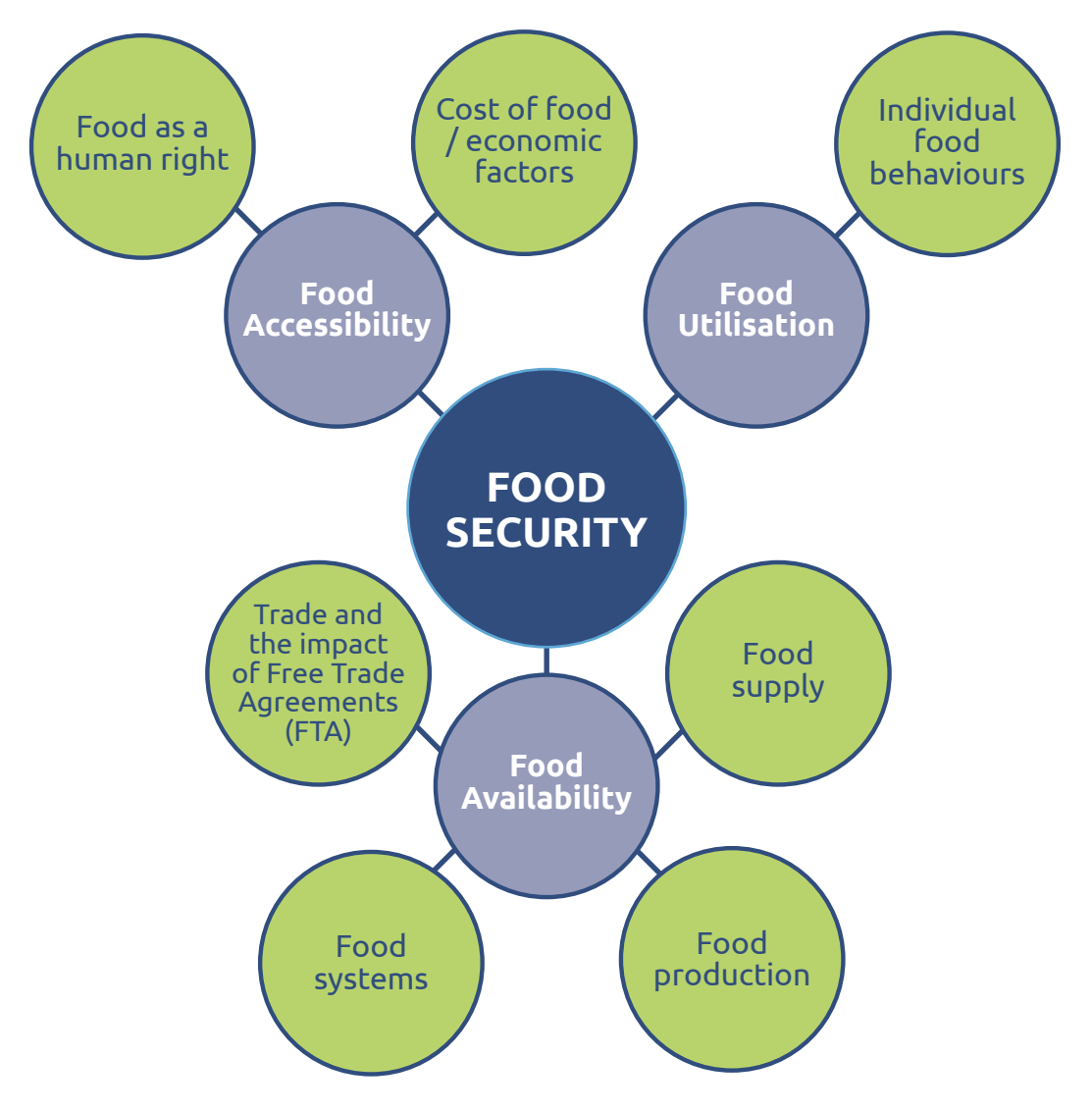
Figure 1: Summary of key determinants and pathways

This section provides an understanding of the individual and cumulative direct health and well-being impacts and the groups potentially affected.