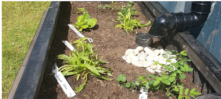
Example of a sustainable drainage system (SuDS), from Keep Wales Tidy

The campaign ' Deforestation Free Nation ', from climate change charity Size of Wales, calls on public bodies to eliminate imported deforestation from their supply chains by avoiding unsustainably produced commodities, such as beef, soya, palm, coffee and cacao, and choosing certified alternatives instead, such as Fairtrade coffee and products containing RSPO certified palm oil.