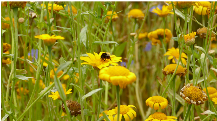
Wildlife Garden from Keep Wales Tidy

The WHO Manifesto provides a structure for all policy decision makers to guide recovery to promote a healthier, fairer and greener world, while investing to restore the economy. At a local level, the WFG Act, which mirrors the United Nations Sustainable Development Goals for Wales, provides a framework to implement the WHO Manifesto, while responding to and learning from the pandemic.